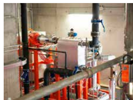
Mestre (VE, Italy) - Heat recovery from biomass-fueled boilers and hot-air turbines