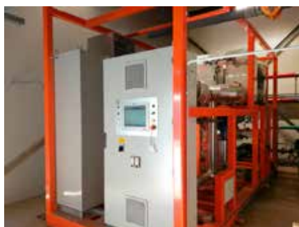
Rovato (BS, Italy) - Power generation from biomass-fueled boiler (end-of-life pallets)