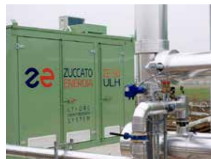
Borgoforte (MN, Italy) - Heat recovery from jackets and fumes of biogas-fueled gensets

For a more up-to-date and exhaustive list of our references, please consult the "References" section of our website, www.zuccatoenergia.it .