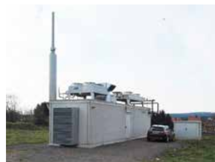
Benneckestein (Germany) - Heat recovery from jackets and fumes of biogas-fueled gensets