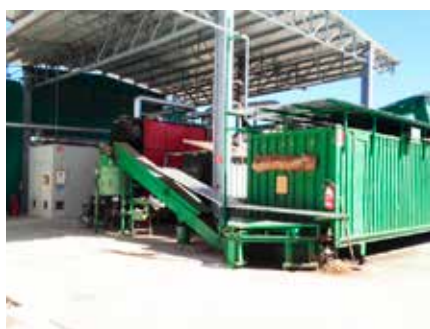
Sommalombardo (VA, Italy) - Power generation from biomass-fueled boiler (sawmill residues)

Zuccato Energia ORC systems have been in use for years in several installations : the following photos show some of them.