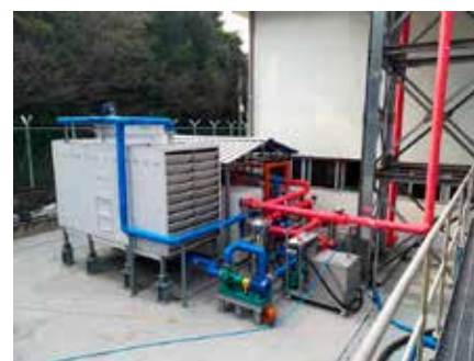
Heuksan (South Korea) - Heat recovery from thermoelectric power station (heavy oil gensets)