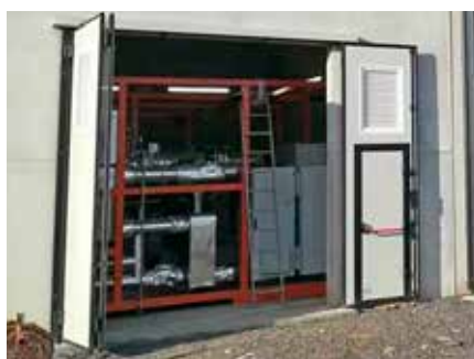
Città della Pieve (PG, Italy) - Power generation from biomass-fueled boiler (pruning residues)