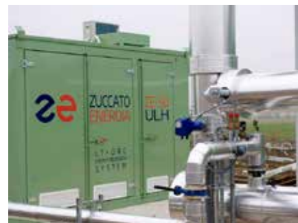
Borgoforte (MN, Italy) - Heat recovery from jackets and fumes of biogas-fueled gensets

For a more up-to-date and exhaustive list of our references, please consult the "References" section of our website, www.zuccatoenergia.it .