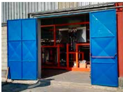
Castrovillari (CS, Italy) Power generation from biomass-fueled boiler (pruning residues)